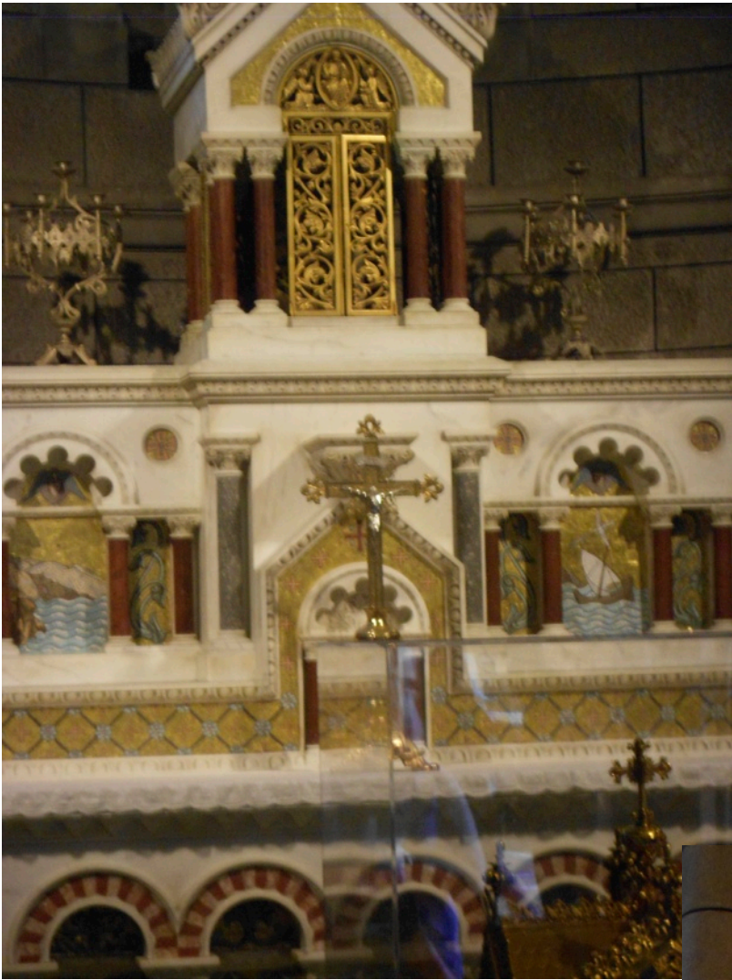
Inside the church.