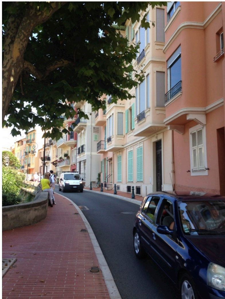
This street of lovely houses is right near the palace.