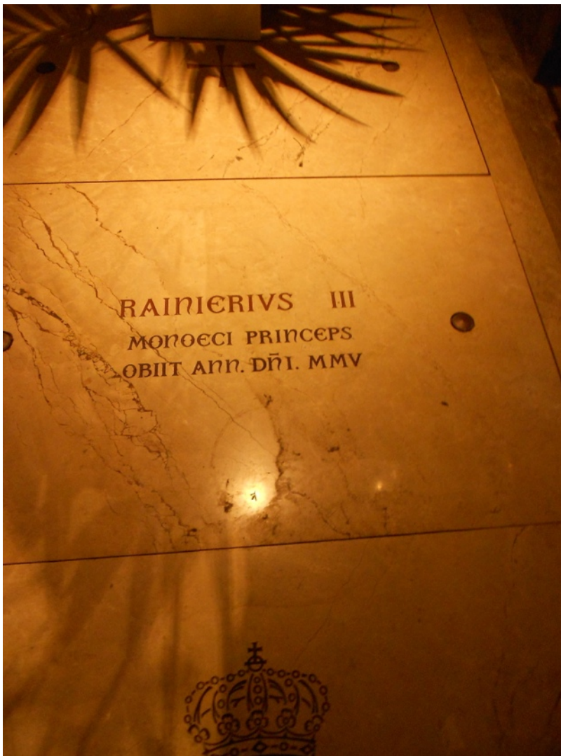
This is the tomb of Prince Ranier inside the church behind the altar.