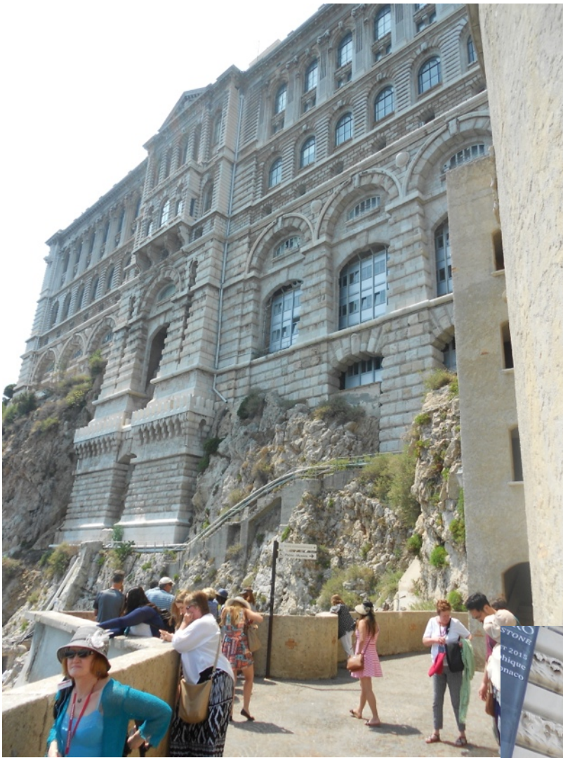
The oceanography museum.