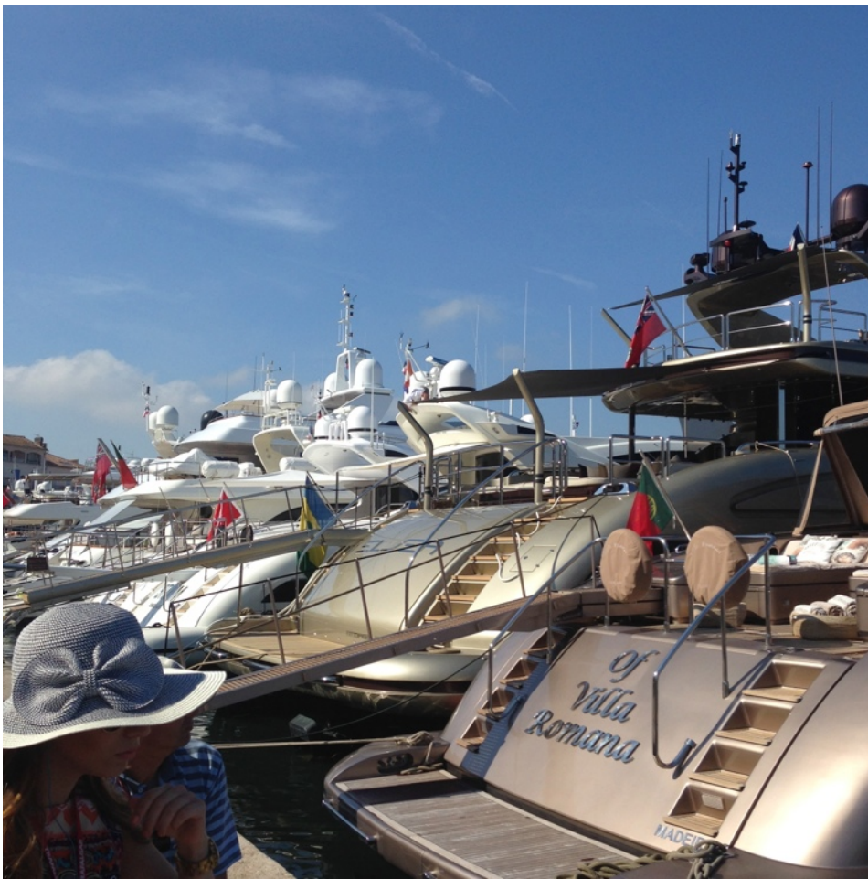
Some yachts docked in the Port of St. Tropez.

Cindy took us on a short walking tour orientation, and then gave us free time to explore, shop and eat lunch. It was market day at St. Tropez.