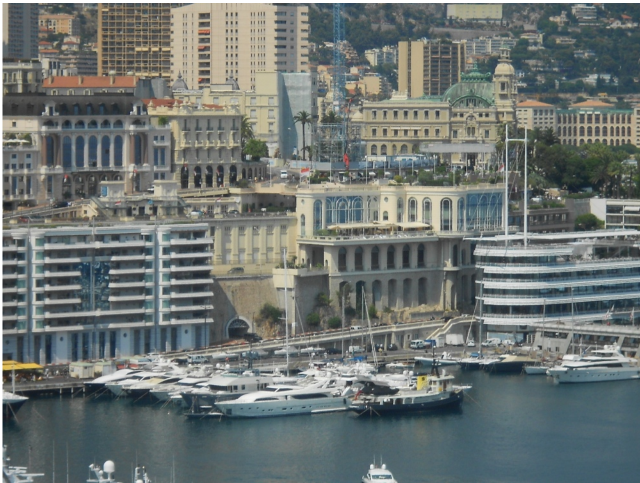
View from up on “the rock” of yachts docked in the port and the city of Monte Carlo. The casino is the beige building with the old green roof in the top right corner of photo.