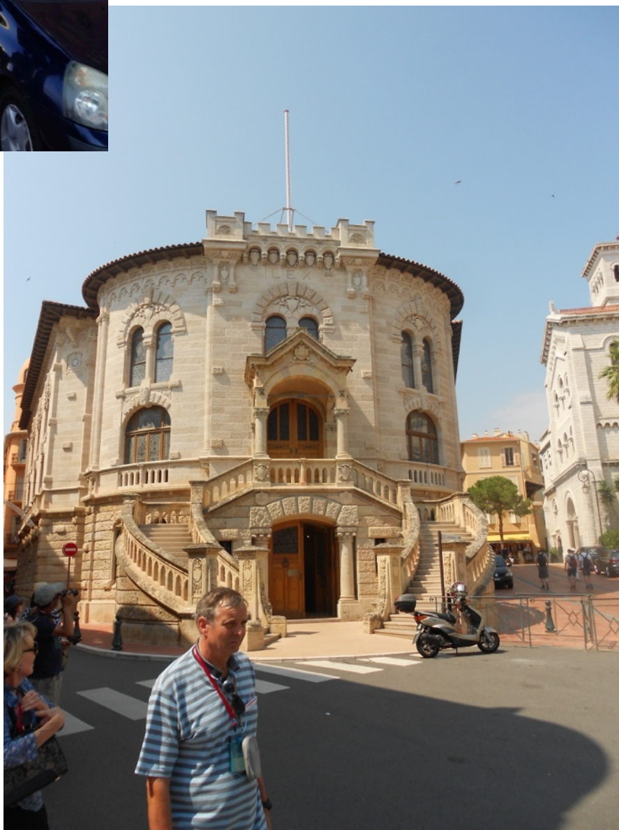
This unique building is right next to the church.